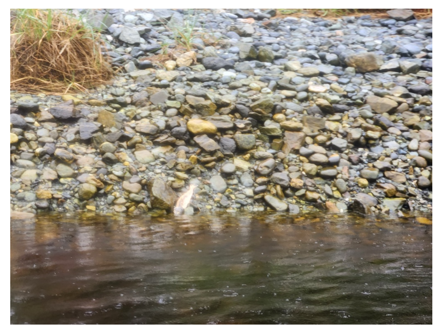
Photo #177 - Image associated with AWC Observation Detail M-AWC-DETAIL-1127