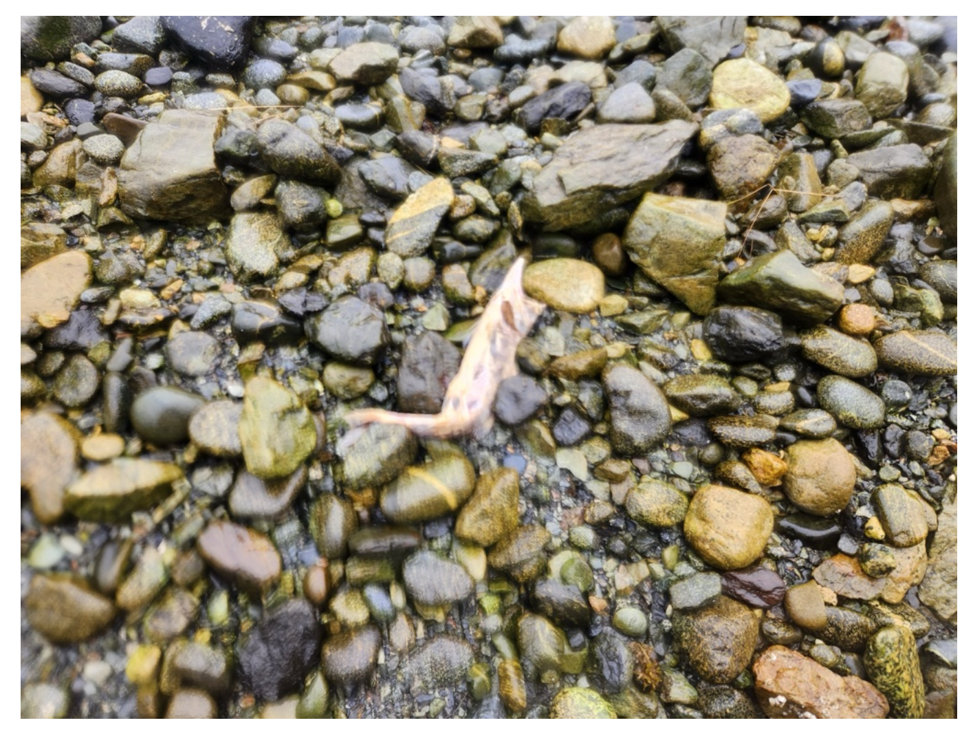
Photo #180 - Image associated with AWC Observation Detail M-AWC-DETAIL-1127