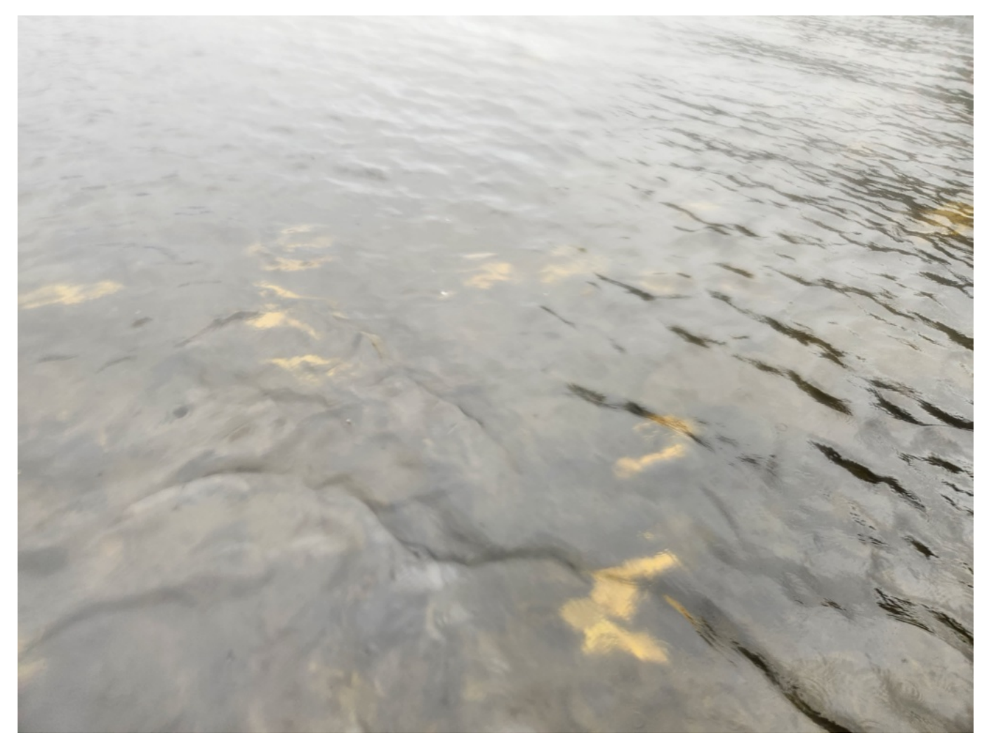
Photo #176 - Image associated with AWC Observation Detail M-AWC-DETAIL-1127