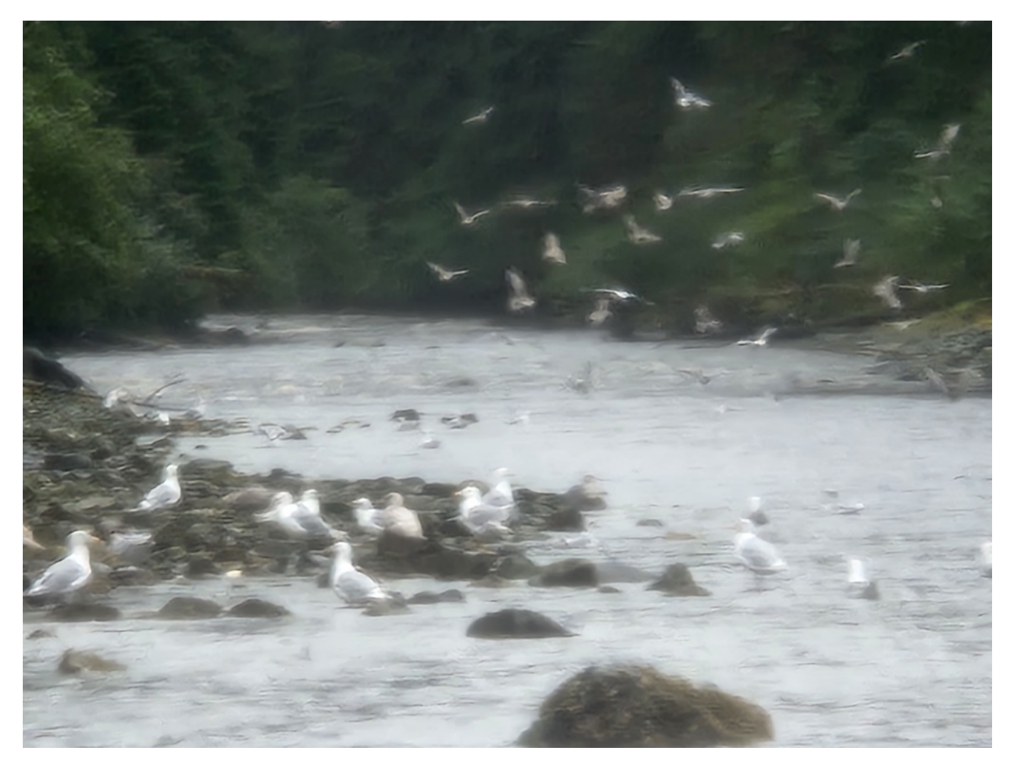
Photo #178 - Image associated with AWC Observation Detail M-AWC-DETAIL-1127